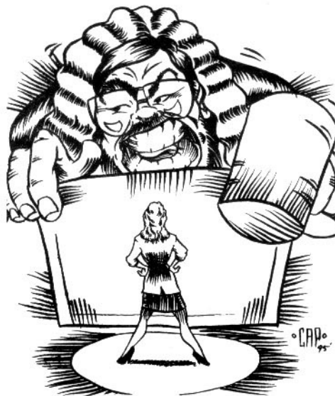
"Move Over, Marcia Clark!"

How long do you suppose OJ would remain behind bars if F Lee Bailey could produce 500 witnesses willing to testify to OJ's presence elsewhere at the time of the murders of which he stands accused? Wouldn't Marcia love to have even 5 eyewitnesses, let